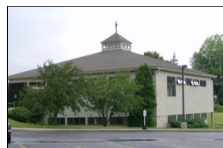
THE EDUCATION CENTER: SITE OF THE CHILDREN'S FORMATION.